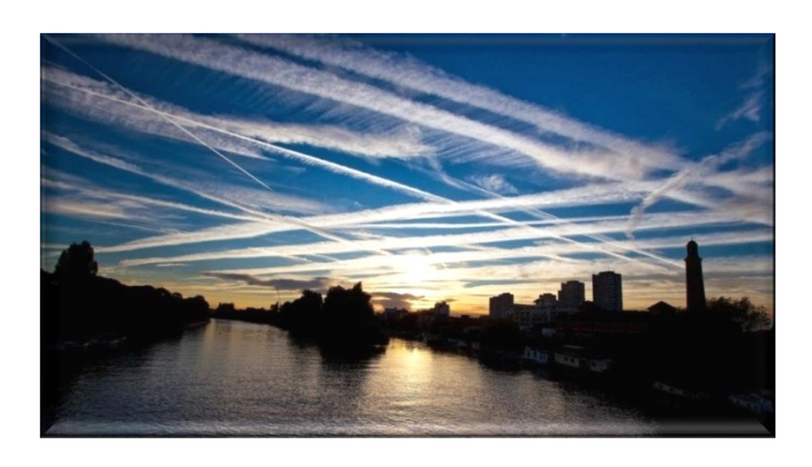
Pic. 4. Excessive airplane traffic over London