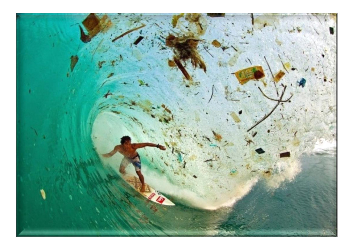
Pic. 27. Indonesian surfer Dede Surinaya conquers a wave