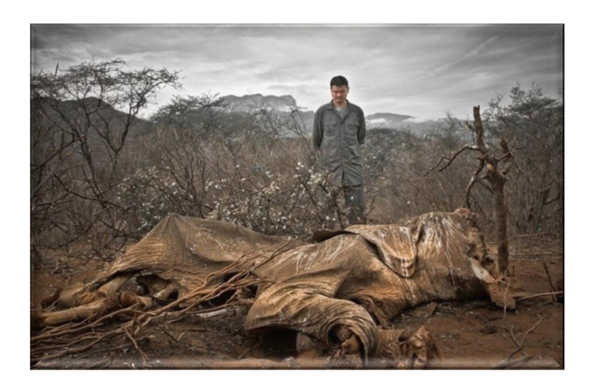
Pic. 2. An elephant killed by merciless poachers. They left him to rot