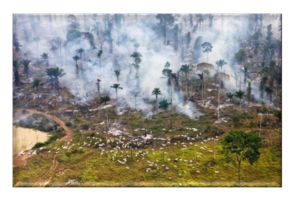
Pic. 3. Fire in the rainforest. Wild goats grazed here once