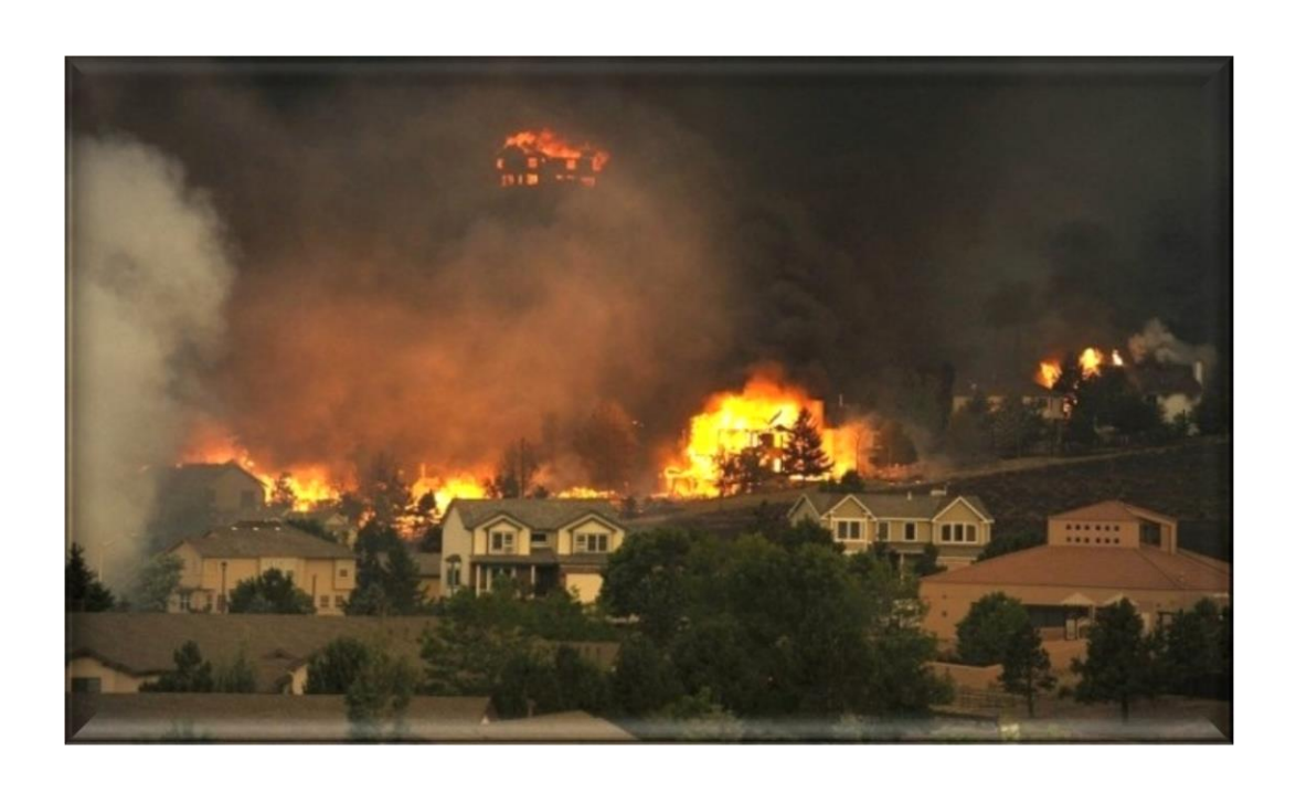
Pic. 8. A fiery storm sweeps across Colorado. A heightened risk of forest fires is a result of climate change