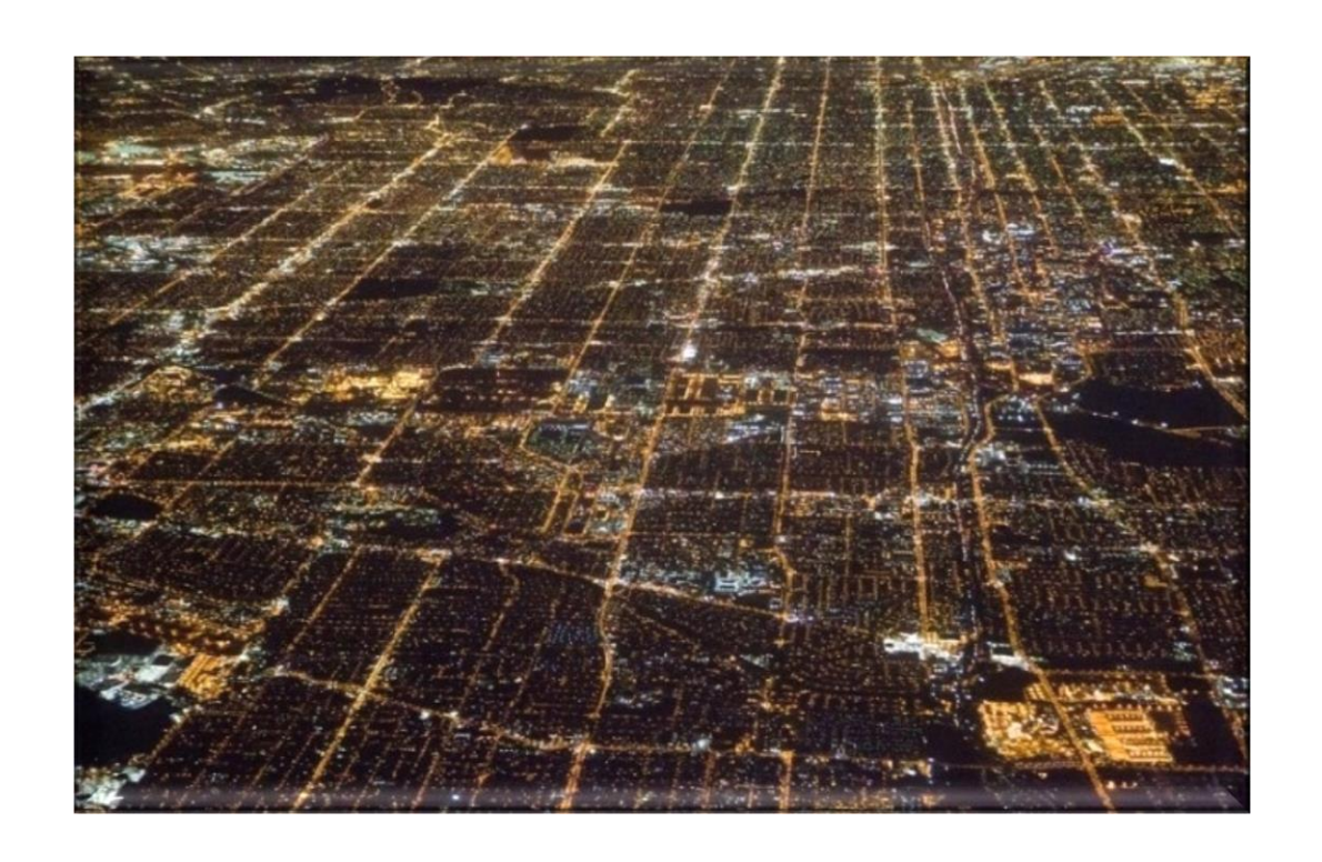
Pic. 10. Night view of Los Angeles. Energy consumption is colossal