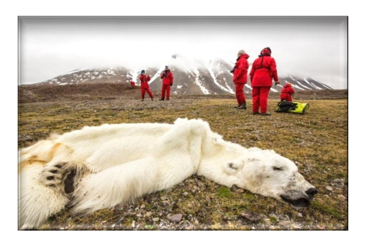
Pic. 23. A polar bear starved to death in Norway. Disappearing glaciers deprive animals of vital territory and food