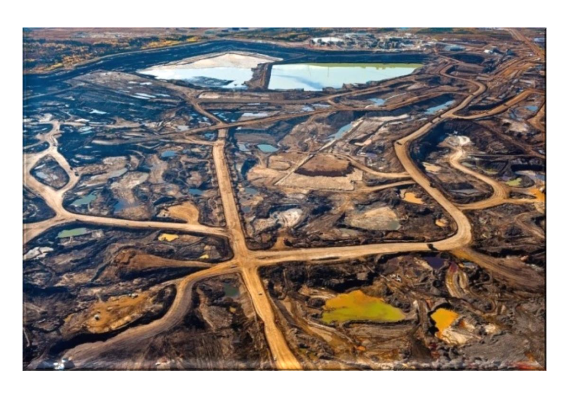
Pic. 9. Traces left from the extraction of oil sands in the Canadian province of Alberta