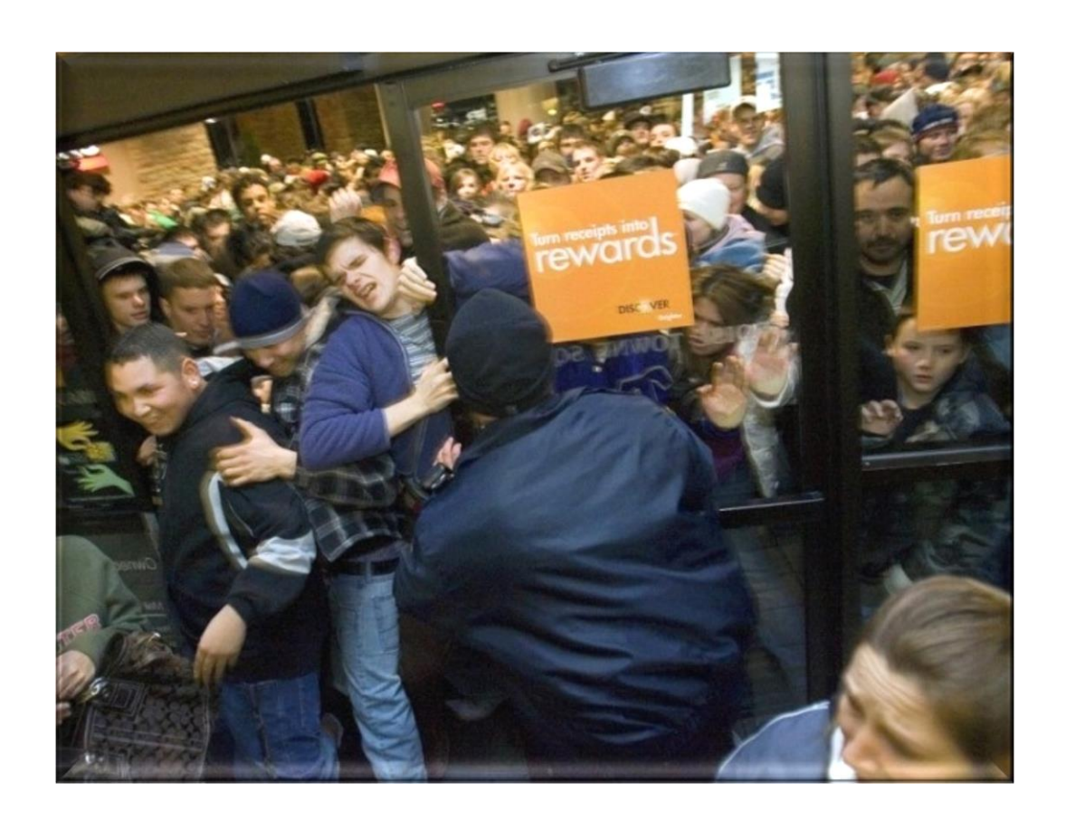
Pic. 18. "Black Friday" in the electronics supermarket. Boise, Idaho