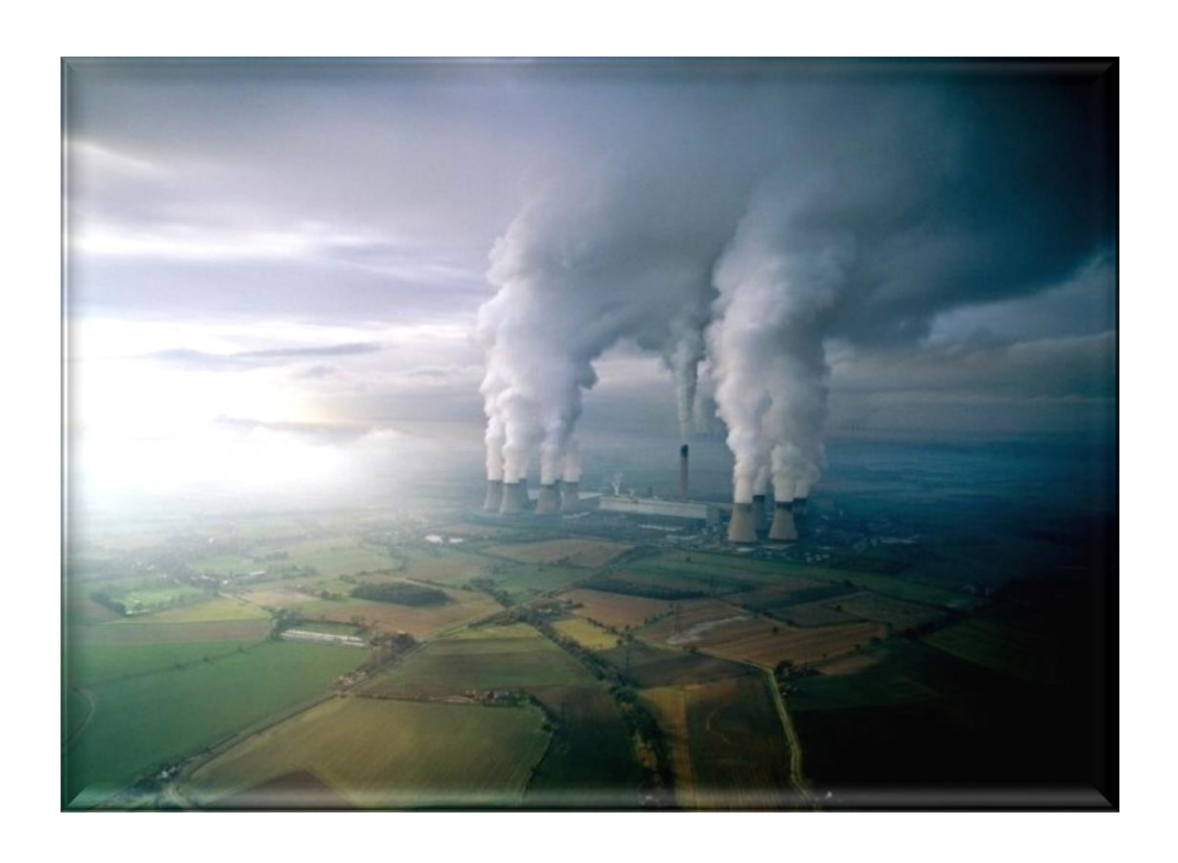
Pic. 26. A brown coal power plant's emission pollutes the air