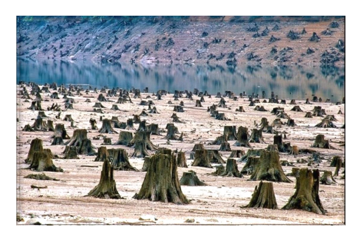
Pic. 11. In Oregon, this beautiful forest was destroyed for the construction of a new dam