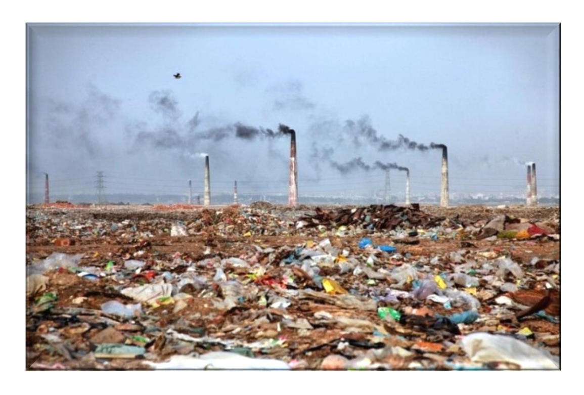
Pic. 7. Incineration plant and its surroundings, Bangladesh