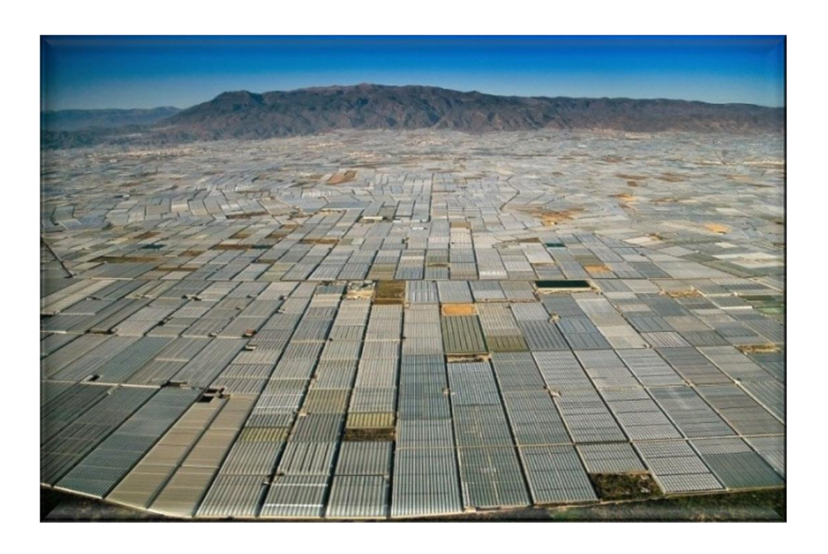
Pic. 12. The region of Almeria in Spain, crowded with greenhouses