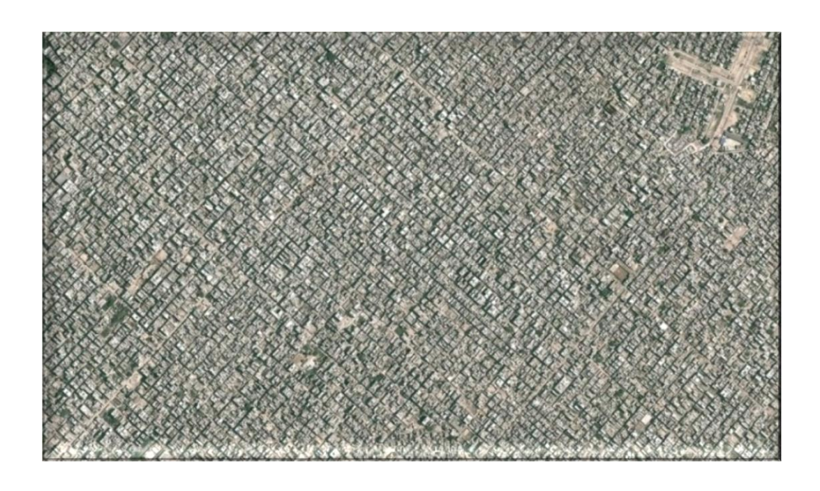
Pic. 16. India, New Delhi (more than 22 million inhabitants) from a bird's-eye view