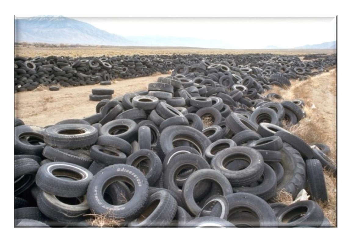
Pic. 21. A landfill of used tires in the Nevada desert