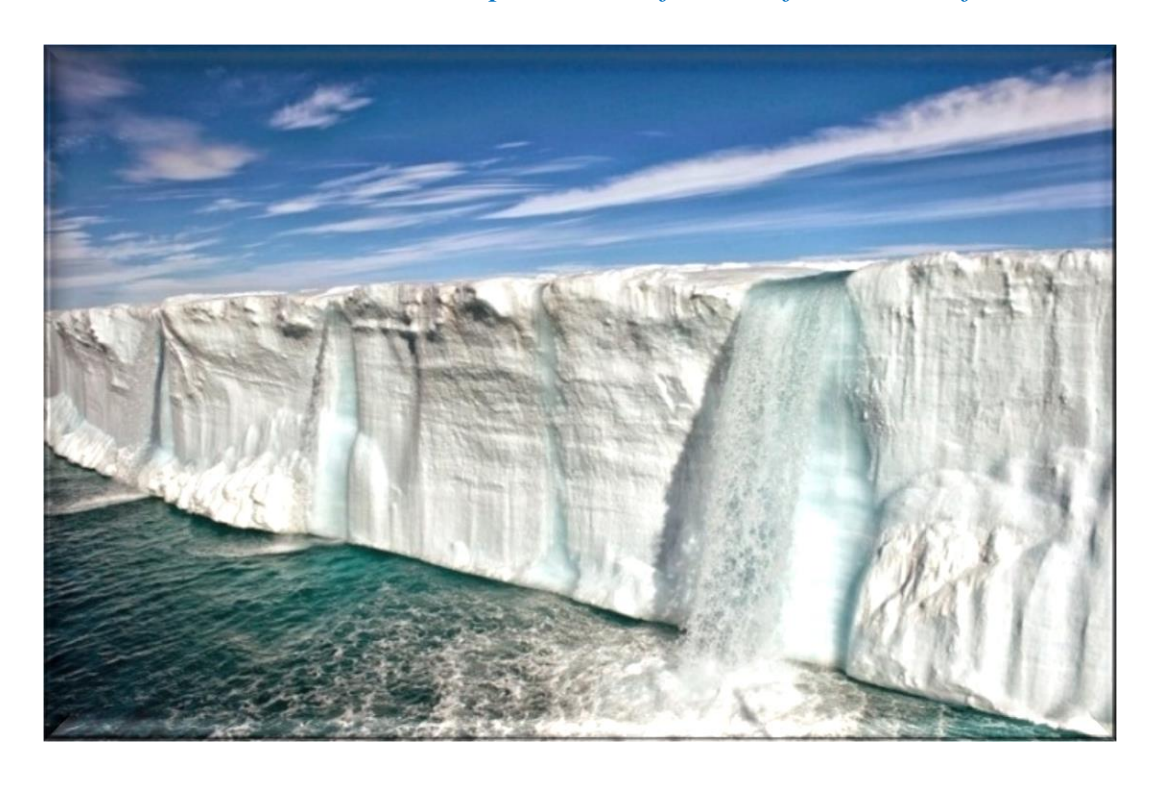
Pic. 25. A melting glacier forms a massive waterfall. Indisputable evidence of how rapidly climate change is evolving