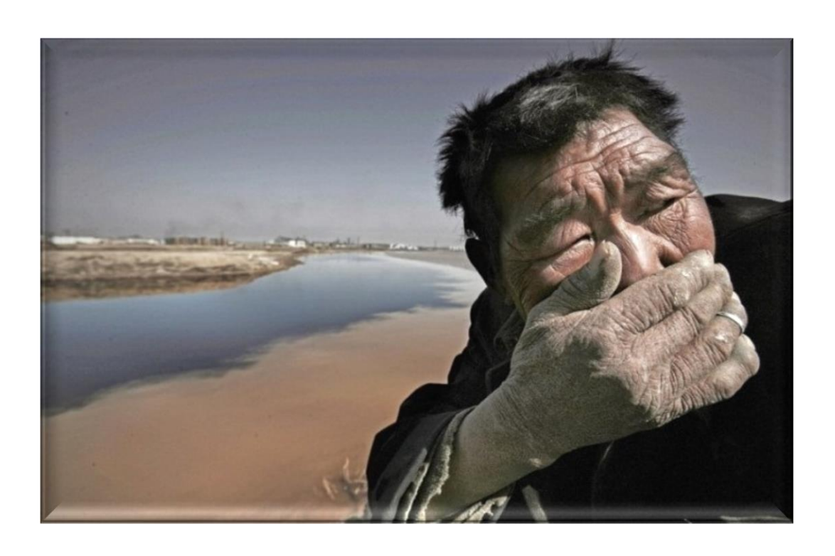
Pic. 6. The stench of the Yellow River in Mongolia is unbearable for people