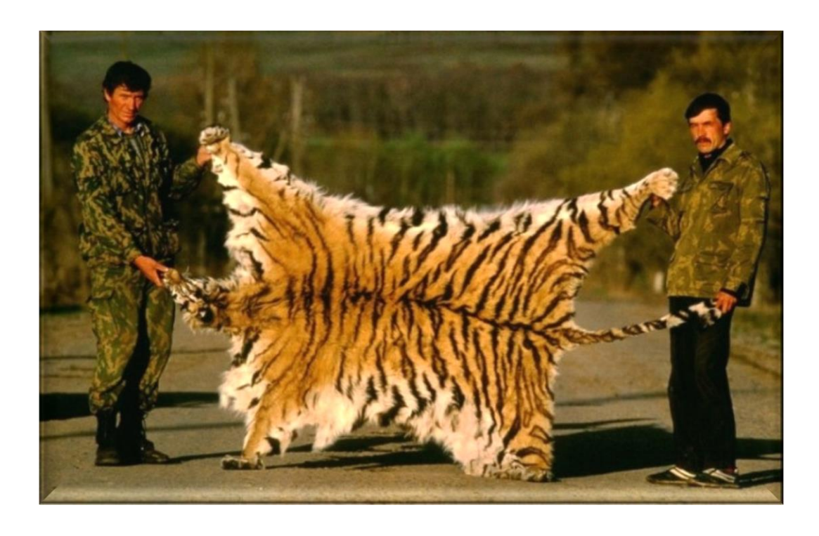
Pic. 13. Poachers proudly pose with the skin of a Siberian tiger they killed