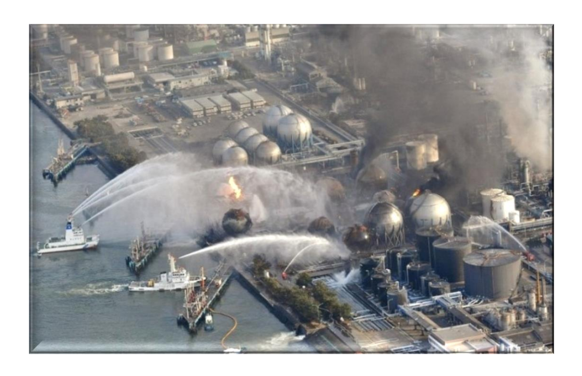
Pic. 22. While the whole world was watching the events of Fukushima in 2011, a few miles further a thermal power plant was burning. All attempts to extinguish the fire were futile