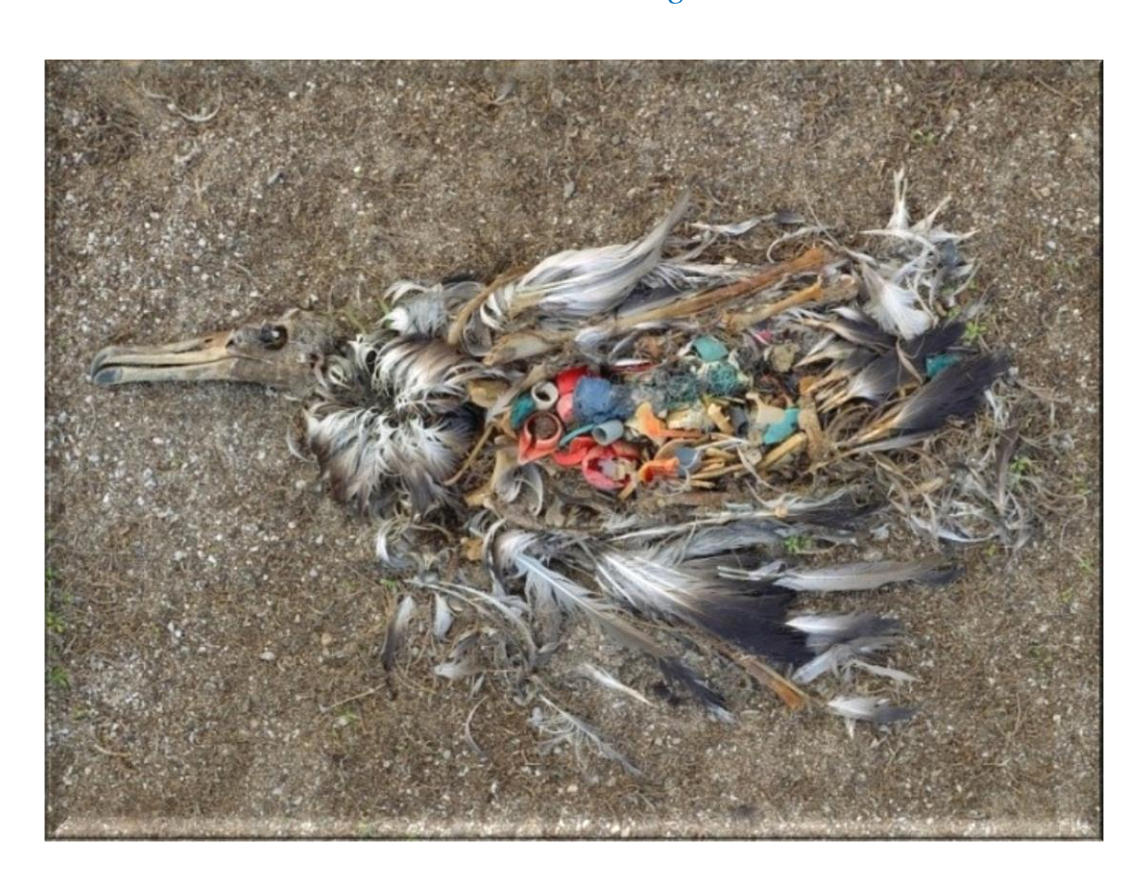
Pic. 15. A dead albatross is torn from the inside by plastic debris. People mindlessly throw their trash out on the streets every day