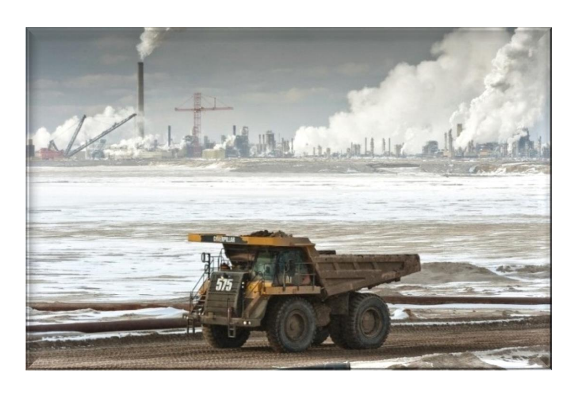
Pic. 5. A huge truck carries piles of sand for recycling. Oil sand is the energy source of the future