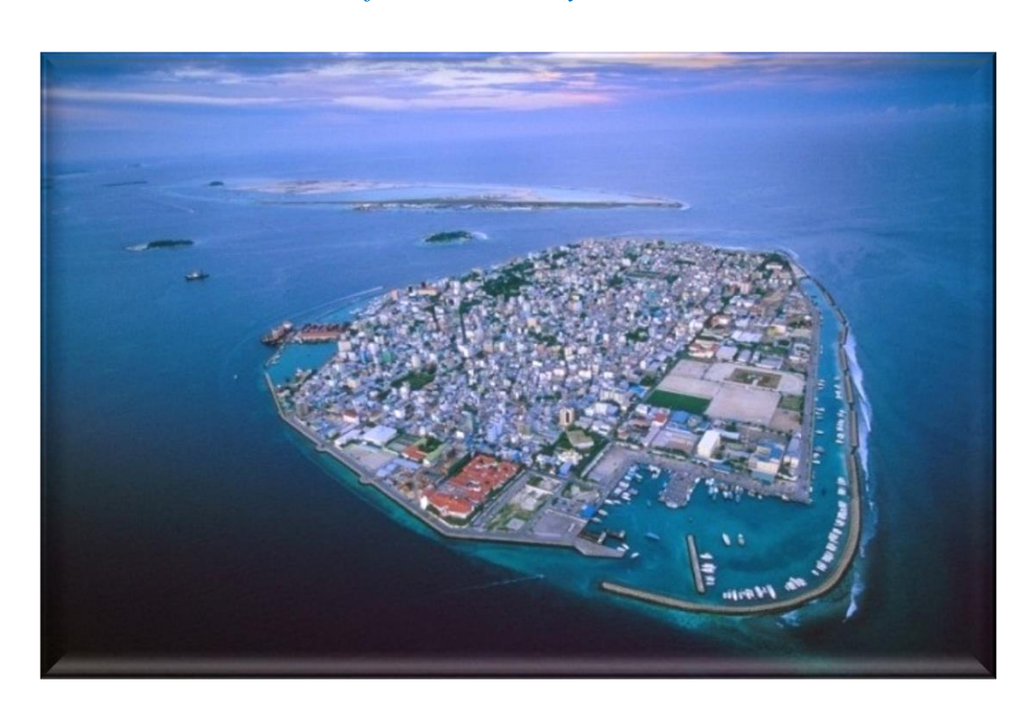
Pic. 17. Maldives, a popular resort, threatened by ever-rising ocean levels