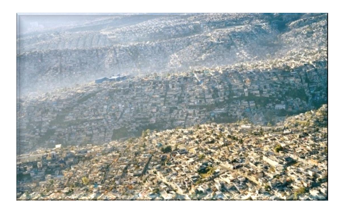
Pic. 1. View of the densely populated Mexico City

Instead of words, just take a look at these 27 photos that most convincingly prove my words that we are in grave danger: