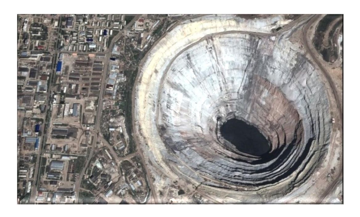
Pic. 14. The mine "Mir" in Russia is the largest diamond mine in the world